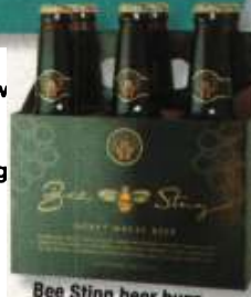
Bee Sting beer buzz

Here's a new brew creating a buzz. Bee Sting honey wheat beer is a first release