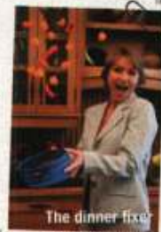
The dinner fixer

★ FIXING DINNER prime time premiere January 9 at 7pm on Discovery Home & Health Channel (D 640)